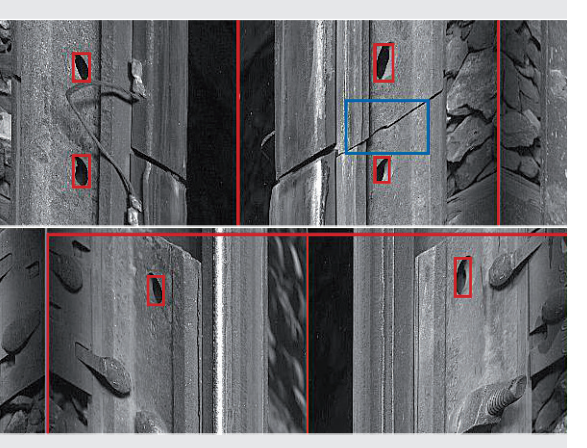
Broken fishplate / joint bar; missing bolts